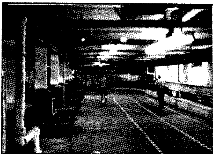
The Underground Track at Marshall Did you know that students helped dig out the track in the 30's?