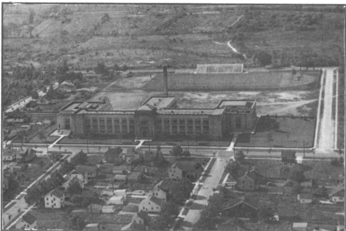
Photo: John Marshall High School 1931 - 1932

John Marshall High School Alumni Association P.O. Box 52 Berea OH 44017-0052