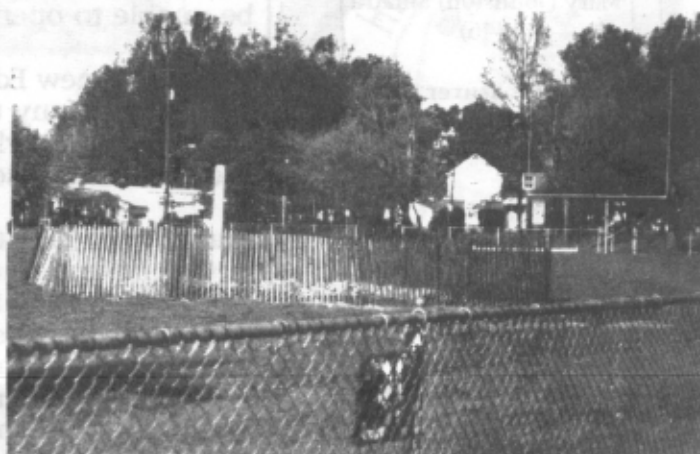
The Lone Sentinel

near midfield. The lone sentinel on the field is a vent pipe marking the spot of the well. Sometime in the near future, the state of Ohio will plug this well with concrete as they have done with hundreds of other abandoned wells throughout the state.