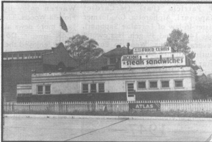
Remember this hot spot opposite the entrance to Hopkins Airport on Rocky River Dr.?