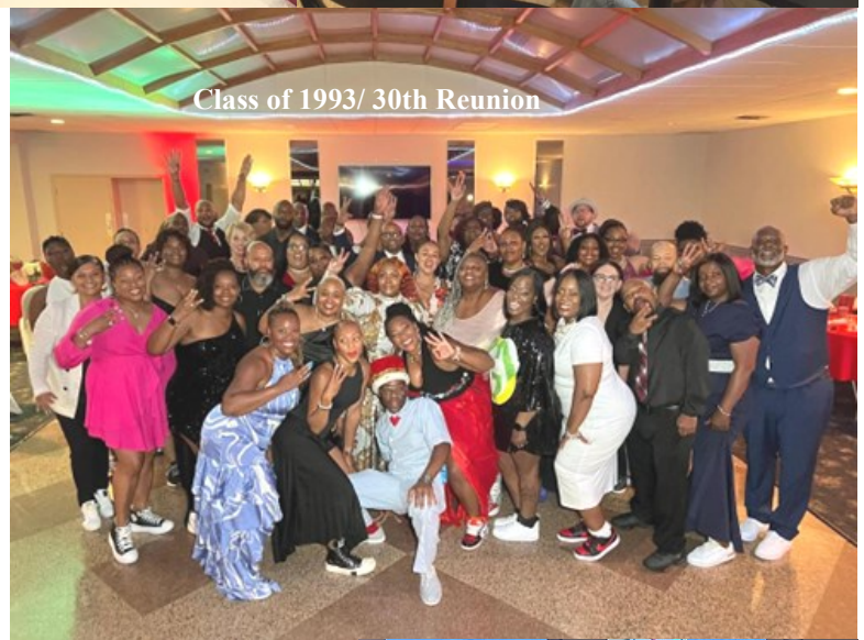
Class of 1993/ 30th Reunion