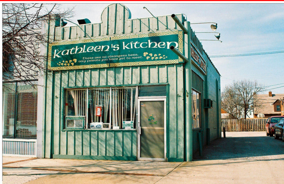
Kathleen's Kitchen, 16804 Lorain Ave, Cleveland, Ohio. March 29, 2006