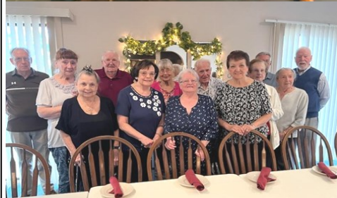
Class of JAN/June 1958 / 65th Reunion