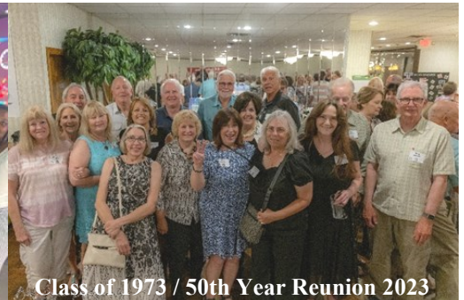
Class of 1973 / 50th Year Reunion 2023