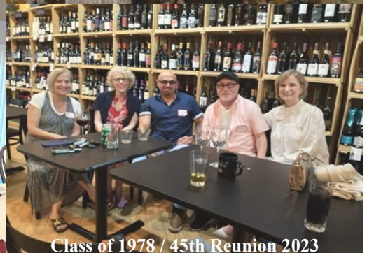
Class of 1978 / 45th Reunion 2023