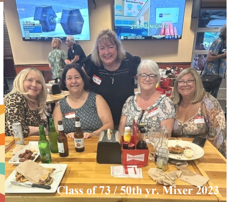
Class of 73 / 50th yr. Mixer 2023