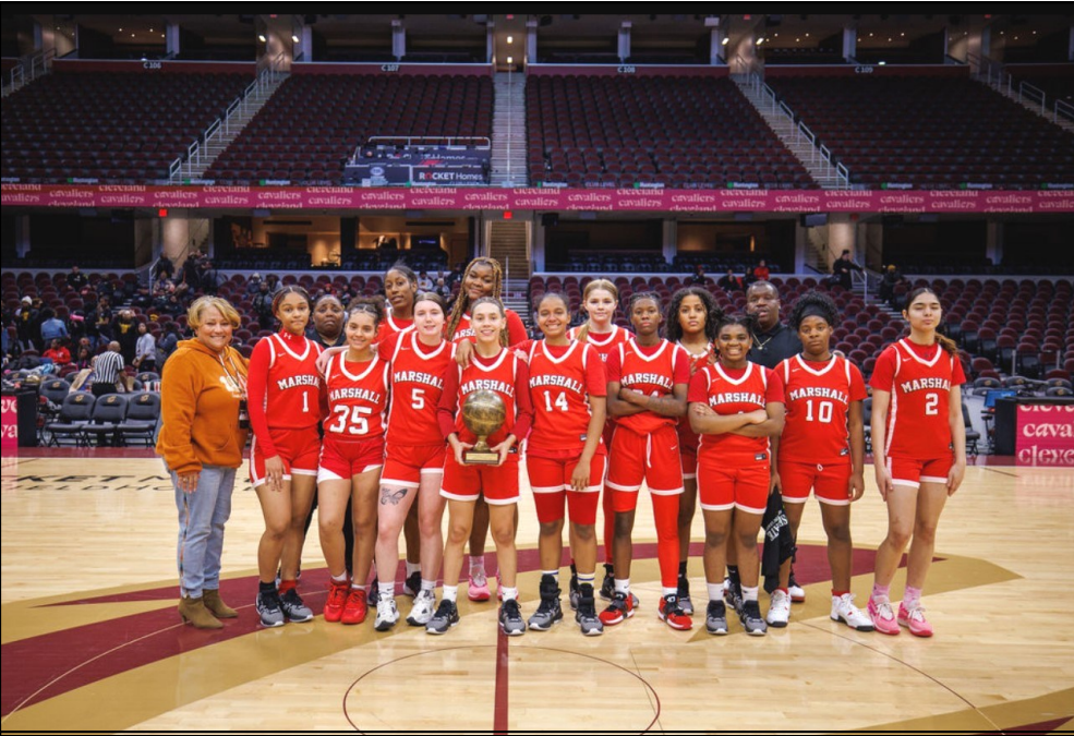
John Marshall High School Girls Basketball Team are the Senate runner's up for this years league championship!