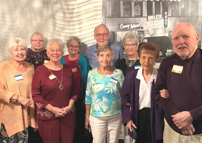
Class of JAN 1959 / 64th Reunion