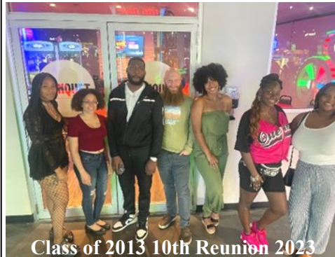
Class of 2013 10th Reunion 2023