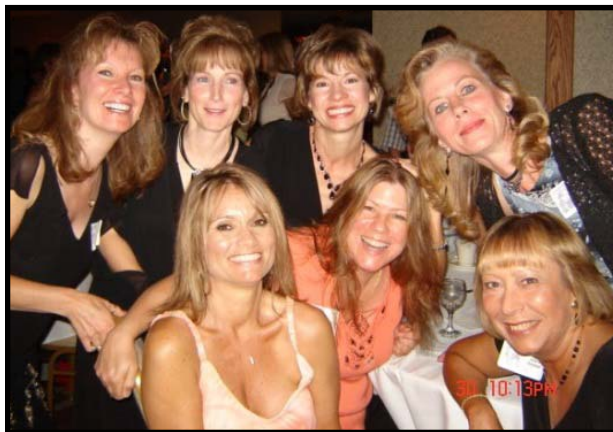
Class of 1977 Reunion—June 30th, 2007