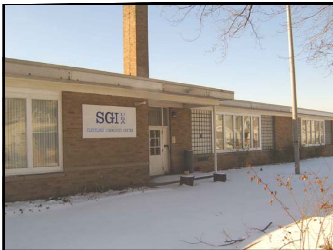
Former Tom L. Johnson Elementary, 13111 Crossburn