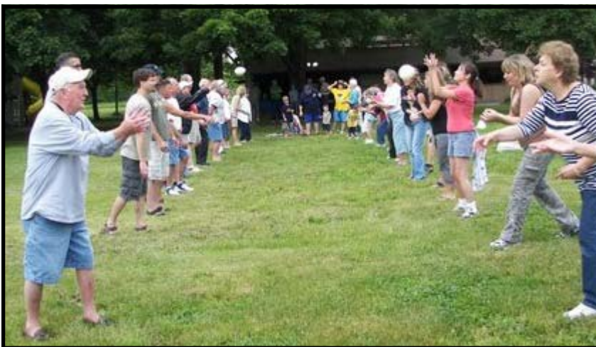
May 27, 2007—The All Alumni Picnic was held again at Melody Grove in North Ridgeville. The event will be held again this year on Sunday, May 25, 2008. See page 15 in this newsletter for more info.