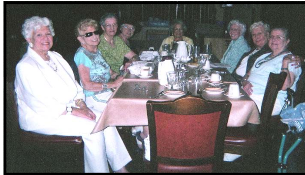
Class of June 1940 - Luncheon, July 2007

day Inn, 4181 W 150th St. $18/person $35/couple,