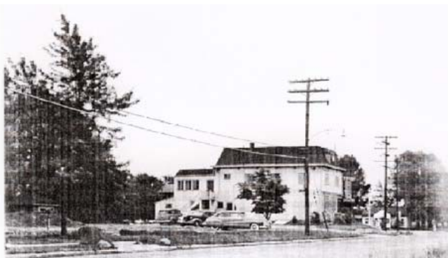
4443 West 150 St, ne cor Puritas & West 150th Bomber Tavern in 1956, photo 1951