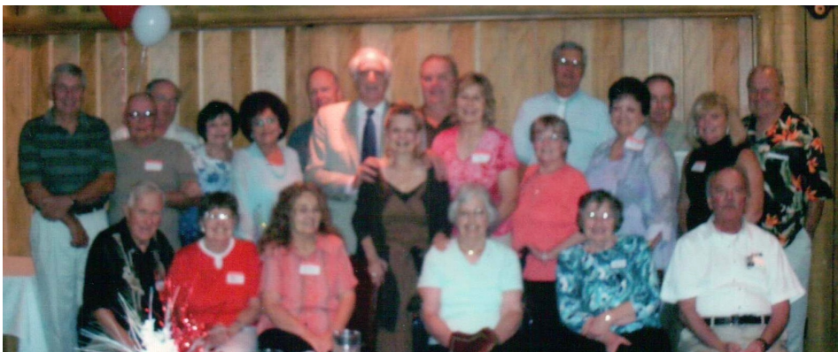
The Class of January & June 1958, at Pipers III TOP: July 15, 2011 BOTTOM: November 11, 2011