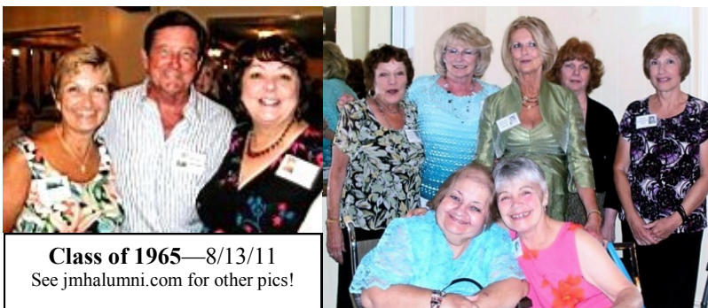
Class of 1965—8/13/11 See jmh alumni.com for other pics!